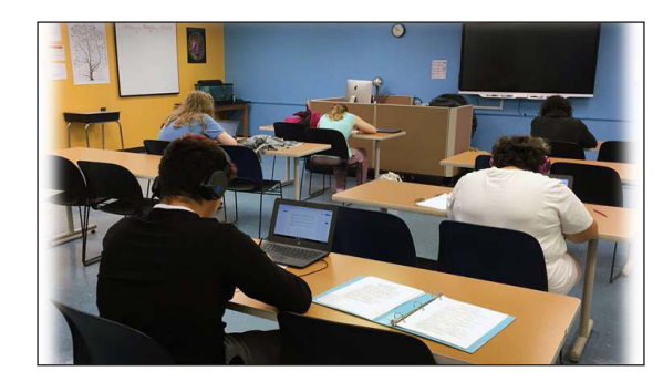
This alternative secondary program is a comprehensive model whose primary components consist of:

Gateway High School staff actively plan and work with students to assist them in achieving their educational, vocational, and postsecondary goals.